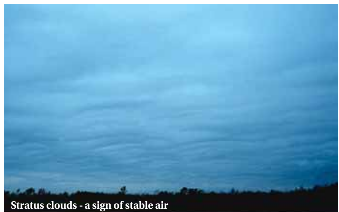
Stratus clouds - a sign of stable air