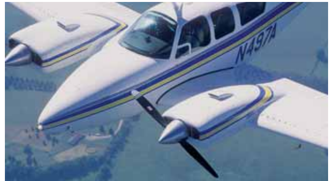
Feather the "dead" propeller in a twin after verifying that the engine has indeed failed. At low altitudes or airspeeds, it may be necessary to feather immediately.

Propellers are another issue. A windmilling propeller adds drag, decreasing the glide performance of the aircraft. In most multiengine aircraft, pilots can solve this problem by feathering the "dead" propeller. Pilots of single engine aircraft don't have that option, but if the airplane has a constant speed propeller (and enough oil pressure), putting the propeller control in the low-rpm (aft) position will increase the blade angle and in many cases give a noticeable improvement in glide performance.