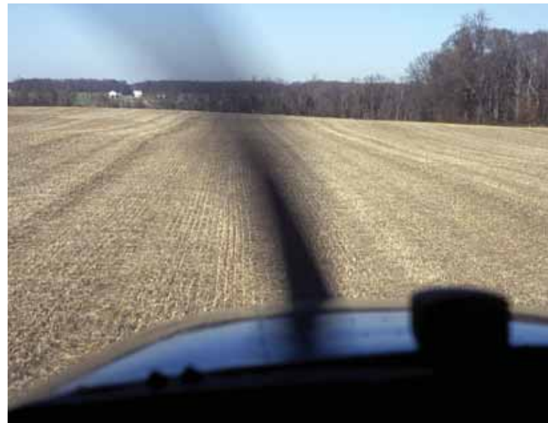
The moment of truth. Low airspeed is preferable in off-airport landings, but don’t stall the airplane trying to achieve the slowest possible touchdown.

Having chosen a landing spot, it’s time to make sure that the aircraft and its occupants are prepared for the landing.