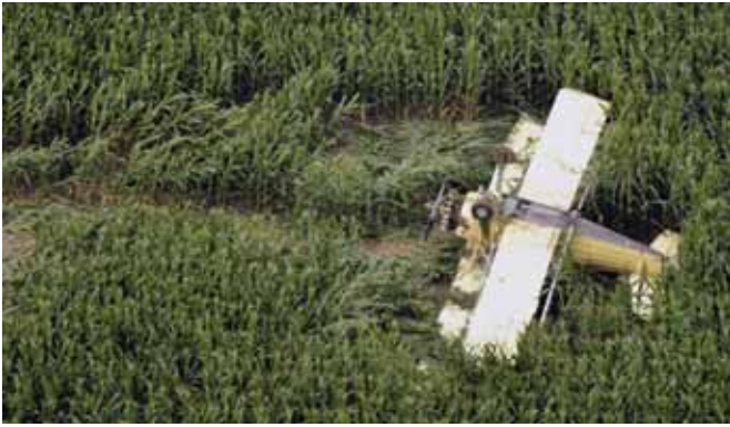
This crop duster came to grief after a forced landing in a cornfield. If possible, avoid fields with tall crops.