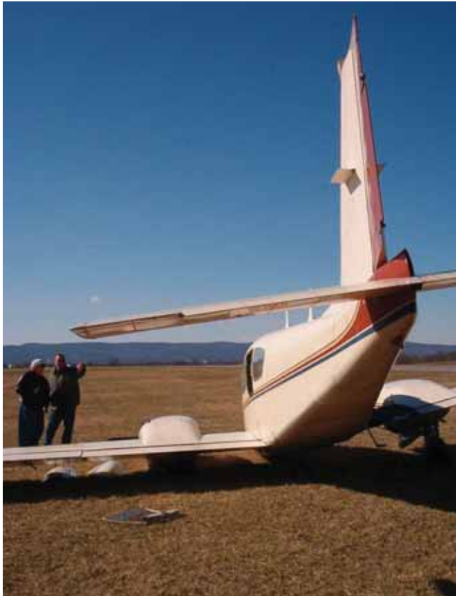
Gear-up landings usually cause only minor damage. The aircraft in this photo was repaired and flying again in a matter of weeks.

Troubleshoot a landing gear issue within reason, but don't put the aircraft at risk doing so. Despite the intense scrutiny they often receive in the media, most gear-up landings are uneventful, highly survivable, and relatively damage-free. It's worth remembering that fact when tempted to try a "stunt" to get the gear down.